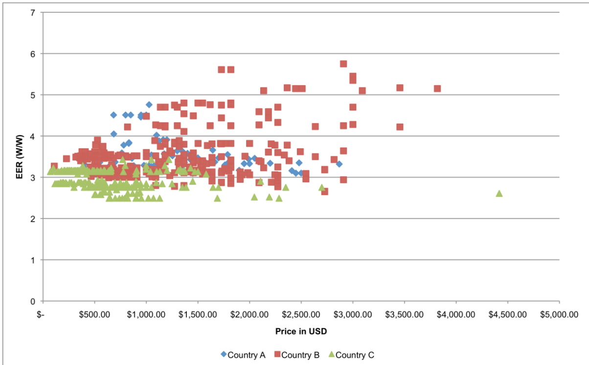
Figure 3: Price-efficiency Comparison of Room ACs

A key additional benefit to the data framework is the ability to compare price to efficiency across markets. In the chart below, we show an illustrative example using real data to compare the average EER (in Watts Output/Watts Input), which has been normalized to W/W, and retail price level in US dollars for Room ACs across three different markets. This type of analysis could be automatically generated based on any interval (i.e. daily, weekly, monthly, quarterly) and using any price bucket (i.e. specific dollar amounts as shown below or more general divisions such as low, medium, or high). In addition, it could be filtered by size to look at the price-efficiency relationship for Room ACs of a specific cooling capacity.