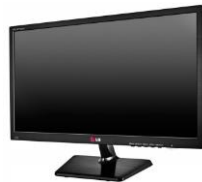
Winner: LG 16EN33SA

(15 inches to less than 20 inches, 1.04 megapixel minimum resolution)