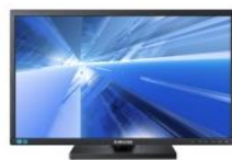
Winner: Samsung S27C450B

(23 inches and larger, 2.07 megapixel minimum resolution)