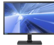
Winner: Samsung S22C200B

(20 inches to less than 23 inches, 1.44 megapixel minimum resolution)